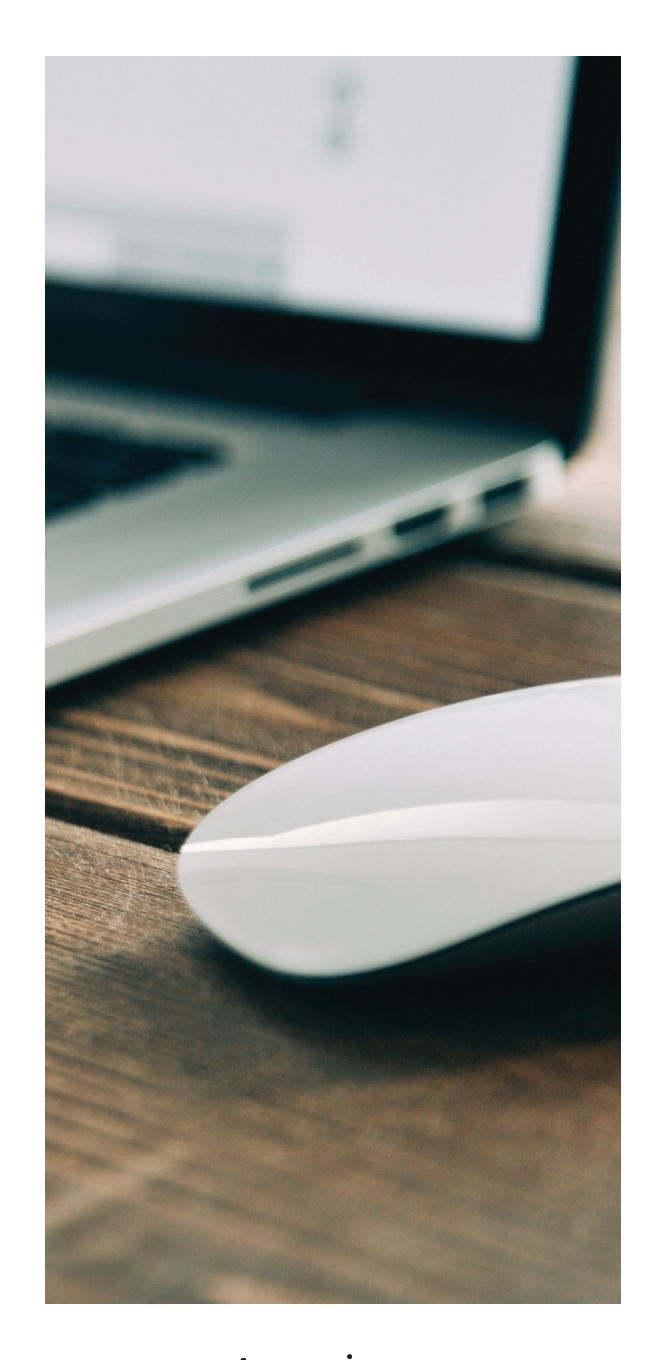
Anytime Anywhere Convenience